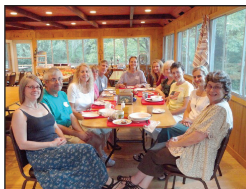
MHTP Module 3 students and staff at Pumpkin Hollow, NY, Summer 2011.

Once again, we are offering a module sale for CEUs (15 CEUs per module). Our curriculum is enhanced every year, and we have found that “older” graduates, especially those who graduated before 2006, are unaware that we have quite substantially changed and improved how to assess a patient’s condition and what music is appropriate for that condition. We have also added much new insight into how music heals, and other scientifically-based information, gleaned from research and our ever-deepening experiences in the field of therapeutic music. The usual cost for a CMP to attend a module is half price: $215. If you register for any module in 2012 by April 1, 2012, you may attend for $125. The only limitation may be class size, as we limit classes to 15 people. Check with the MHTP office before registering.